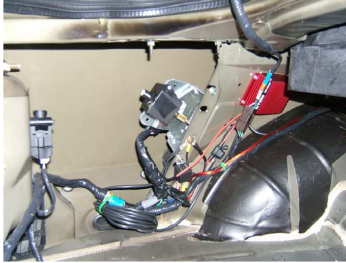
Example of Common Mounting Points for BAP, Boost Controller, & Adapter Plug