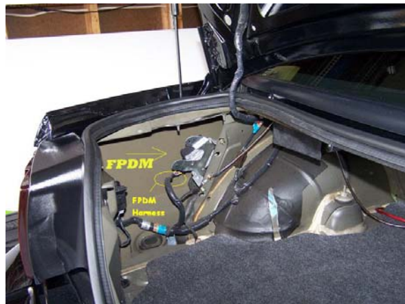
Fuel Pump Driver Module & Harness