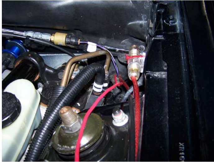
1) 40-amp AGU Fuse Holder & 2) Running the red 8-awg wire through the firewall – Option 2

-Attach the ring lug to one end of the red 8-awg wire and run to the fuse holder location and cut to length and attach to fuse holder.