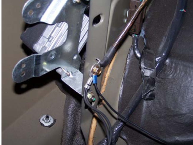
BAP & Wiring Upgrade Grounding Location

11) Attach the BAP grounding wire (Black) and the Wiring Upgrade Adapter Plug grounding (Blue or White) wire (PIN 85) to the location where the FPDM is grounded.